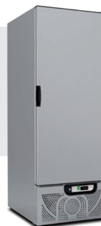
CHEF 600 PX